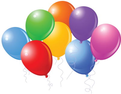
100 Travel Club Members out for the day celebrating Travel Club founder Pam Ingram (nee Smith) 80th Birthday.